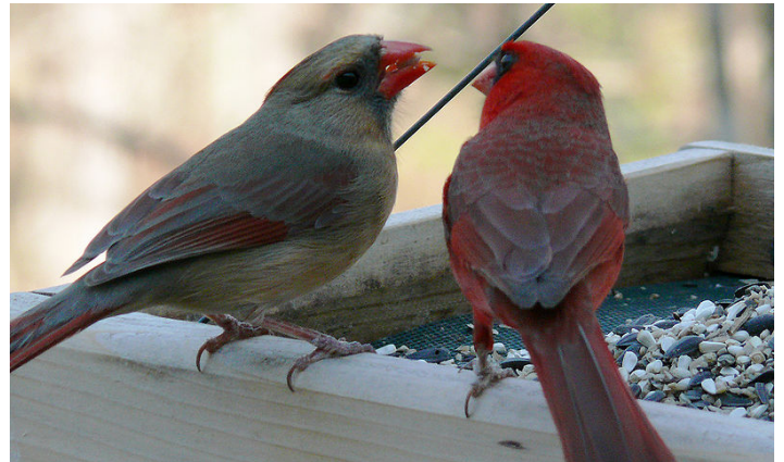
Why is this male giving food to the female? The answer might not be what you expect!